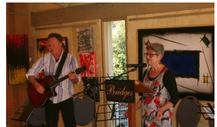
Bridges, Hurstbridge June