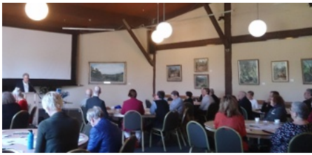
Seniors Summit, November

As our year draws to a close there are many members to acknowledge who have worked hard to make the Nillumbik U3A such a success.