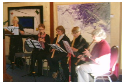
Enrolment Bridges, June