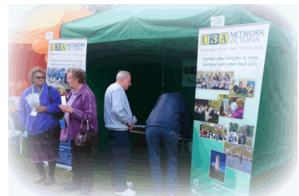
Eltham Town Festival November